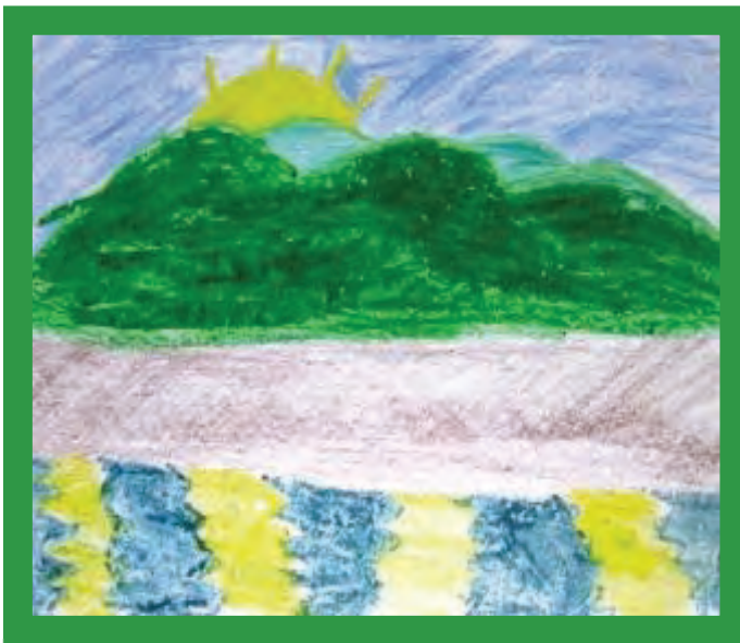
Artwork by Sahara Jack-Kino Age: 8

Wetlands are an integral part of Te Awanui and are recognised as special ecological areas, home to a diverse range of fish, shellfish, and bird, species considered taonga to tangata whenua. In most cases, wetlands indicate that there is not only a river mouth but also freshwater and ‘paru’ (traditional dye) nearby. Due to the early drainage schemes, most, if not all paru sites are gone or their whereabouts no longer known.