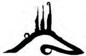
Ngäi Te Rangi