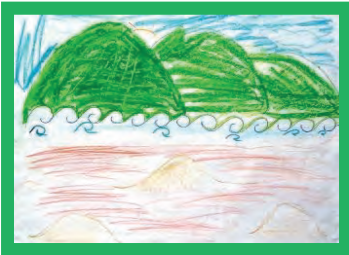
Artwork by Whakawa Kakau Age: 8

Geothermal resources are an intrinsic taonga to tangata whenua. Many of the geothermal sites in Tauranga Moana were used by our tupuna for rituals, healing and cleansing purposes. Those geothermal taonga within Tauranga Moana are undervalued and lack the protection to sustain the unique and valuable qualities of the resource.