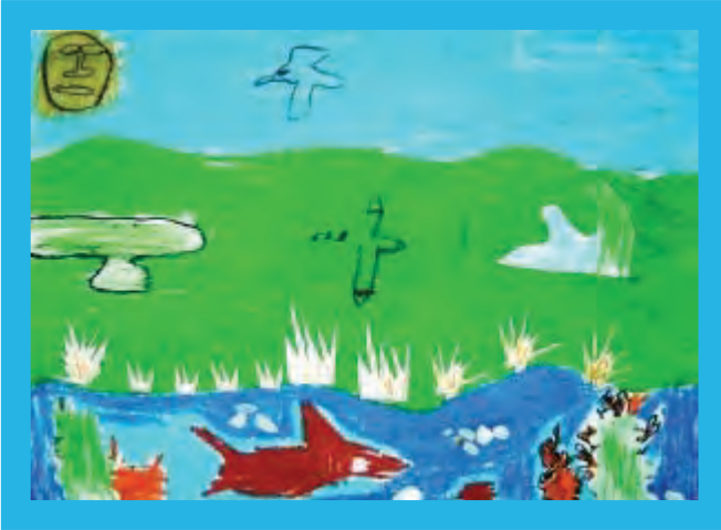
Artwork by James Christensen Age: 9

The spatial allocation of activities in the coastal marine area include the establishment of coastal structures such as marinas, aquaculture structures, slipways, wharves, piers, boat ramps, jetties, moorings, or any other structure used to facilitate access to the coastal marine environment. Such activities may have adverse effects on the foreshore, seabed, coastal waters, and the coastal environment in general.