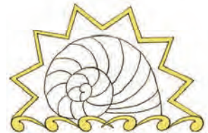
NGÄTI PÜKENGA KI TAURANGA

This document is the cultural and intellectual property of nga iwi o Tauranga Moana; Ngäi Te Rangi, Ngäti Ranginui and Ngäti Pükenga and may not be utilised by another entity without acknowledgement.